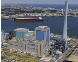
Isogo Thermal Power Plant